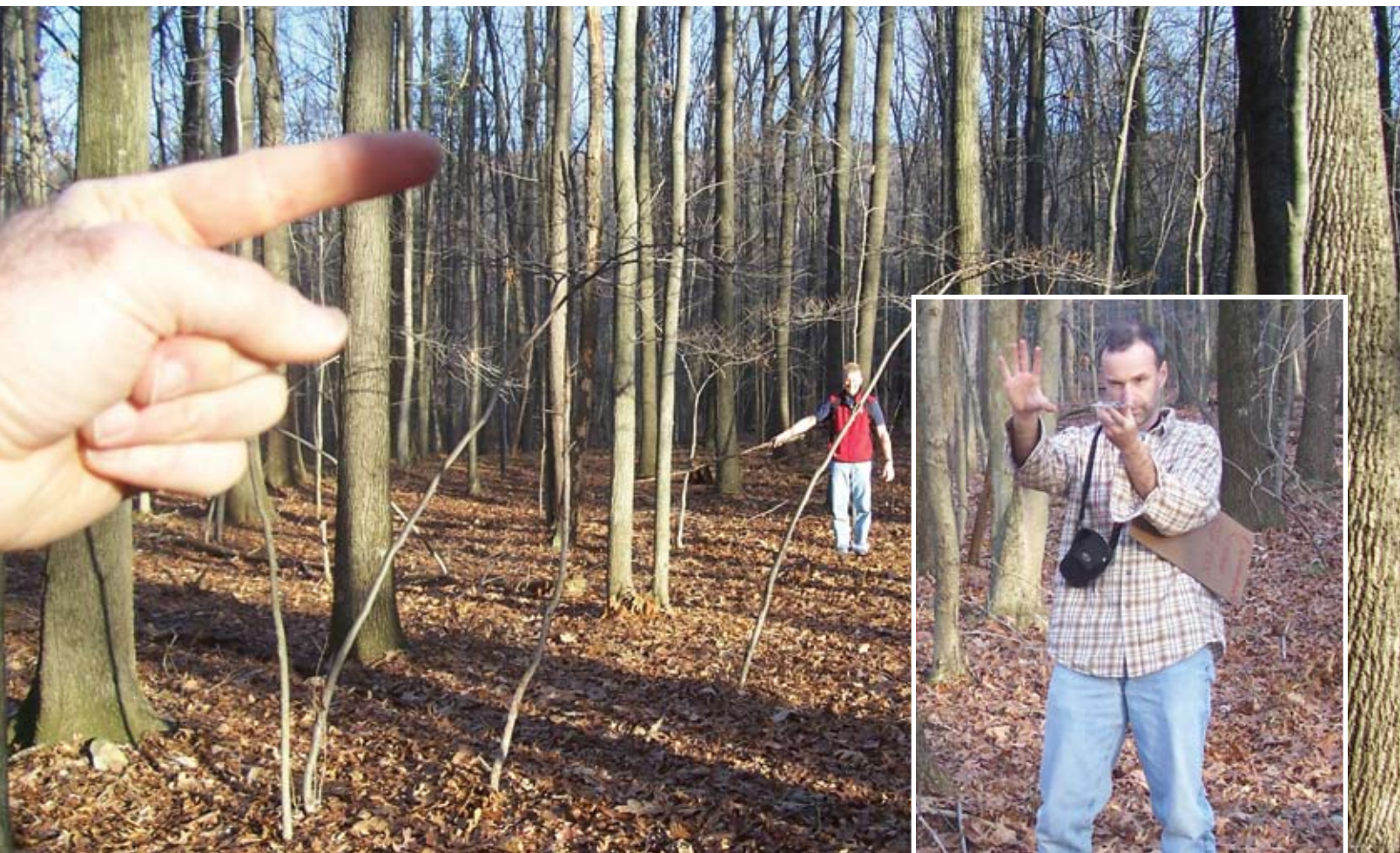
Point sampling can be conducted by a lone person who sights the transect over their compass, selects a landmark along the transect, and paces the chosen distance to the next plot. However, it can help to have a two-person team. The “pointer” (right) sights the transect and guides the “pacer” (above) left or right until they are on the transect. The pacer then marks the plot center. Obviously, this becomes more of a challenge in a dense understory.